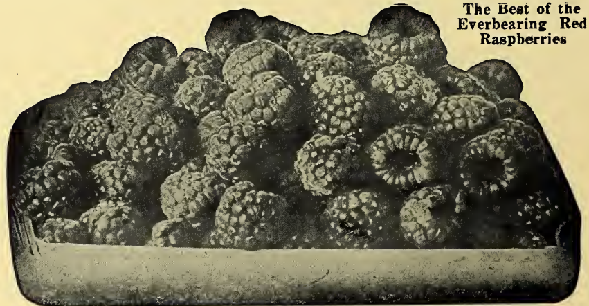
The Best of the Everbearing Red Raspberries

We still have several thousand St. Regis Everbearing Red Raspberries, the best of all the everbearing varieties, which sell regularly at $1.00 per dozen. To dispose of these quickly we will mail you 20 fine plants for only $1.00. Invest this small amount in St. Regis Everbearing Red Raspberries and they will provide enough berries for all family uses. Stock is limited so order at ONCE.